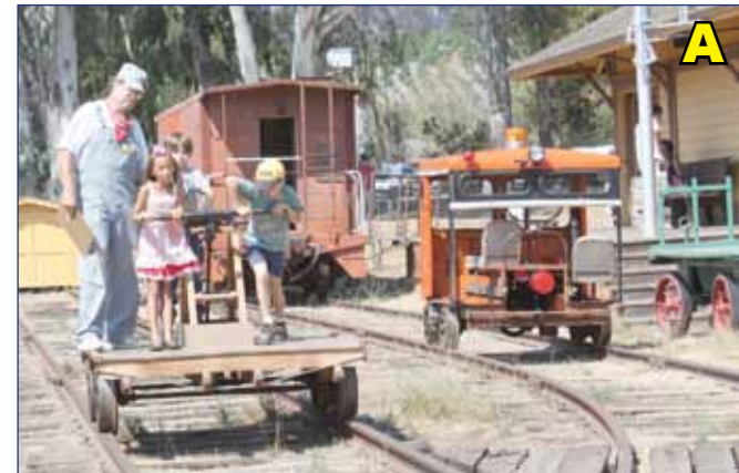
Where can you find all kinds of unusual vehicles - some that you can actually ride?

Sincerely, The Santa Barbara Educators' Roundtable