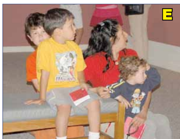
Where can you go to experience wilderness through art?