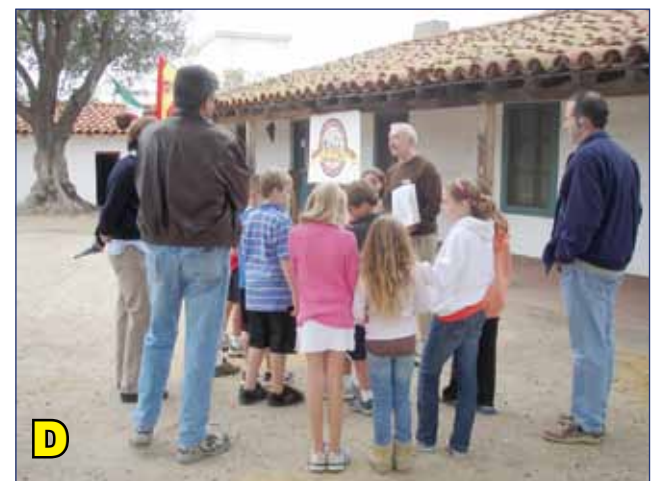
At which historic site in downtown Santa Barbara are these children enjoying Early California Days?