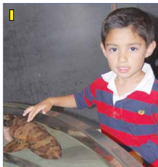
Where can you see a shark face-to-face?