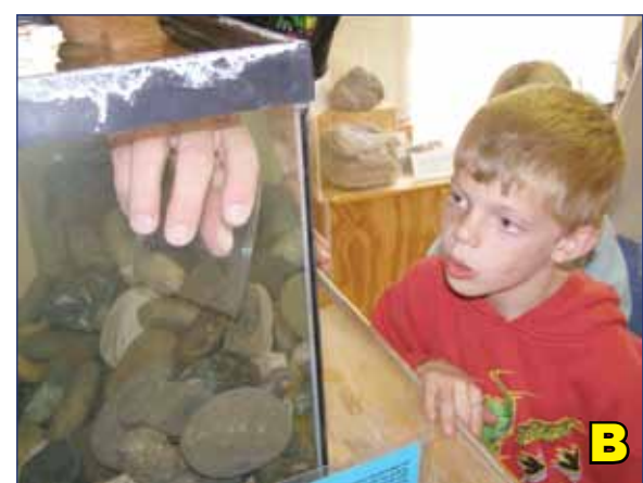
Where can you go to watch trout grow up?