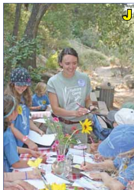
Where can you have fun learning about flowers?