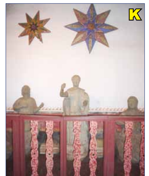
Where can you find the largest statues made by Native Americans in California?