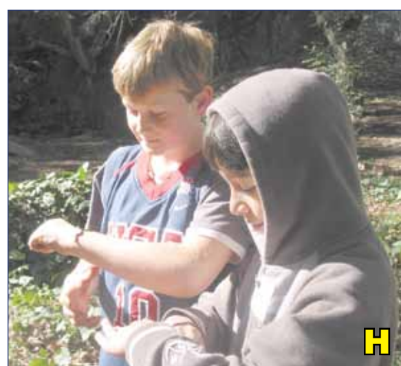
Where can you learn about insects inside a museum hall and then go right outside and look for insects along Mission Creek?