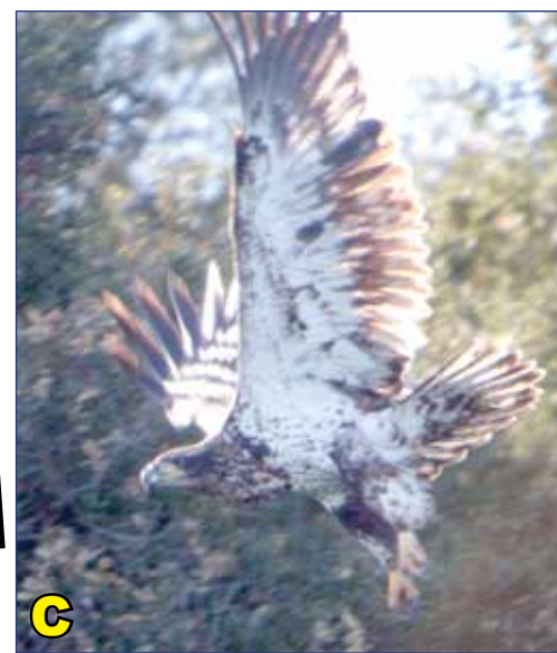
Where can you go see a wild teenage bald eagle?

Can you name the Passport place in each of the photos? Use the clues in the captions. There are lots of other places you can visit to fill your Passport; they are all listed below. Answers are at the bottom of the page.