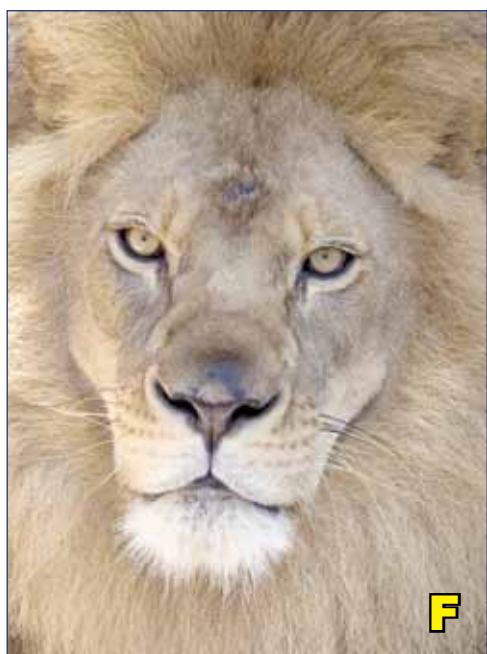
Where can you go to see Chadwick and Gingerbread sleep up to 20 hours per day?